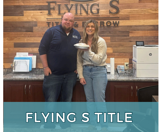
FLYING S TITLE