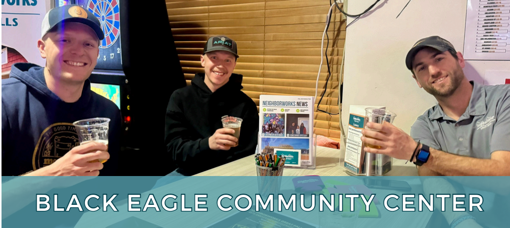
BLACK EAGLE COMMUNITY CENTER