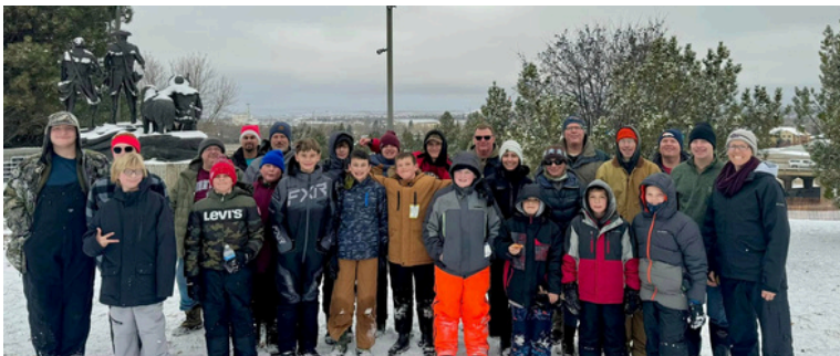
BOY SCOUT TROOP 1014