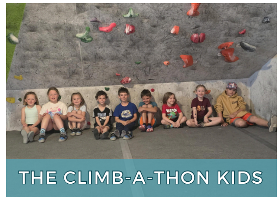
THE CLIMB-A-THON KIDS

NeighborWorks and the Hi-Line Climbing Center teamed up to offer a Community Climbing Day in Great Falls. The climbing day was a way to celebrate the Hi-Line's 8th Anniversary while raising funds for NWGF. In the morning, the kid's climbing team participated in a "climb-a-thon" where they found sponsors to donate a dollar amount per climb. These amazing climbers raised $1,500! Then in the afternoon, community members could enjoy climbing for just $1. NeighborWorks provided a BBQ lunch and raffled off some fun outdoor-themed prizes courtesy of Scheels. NeighborWorks is so thrilled to have partners in all sectors of businesses!