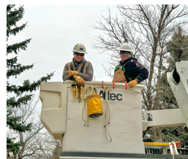
NORTHWESTERN ENERGY VOLUNTEERS

For the last 48 years, the Community Beautification Association has lit up Broadwater Overlook Park for the annual Memorial Christmas Tree Lighting Ceremony. This past year, the torch passed to NWGF. While many enjoy the Christmas lights each year, not everyone knows the meaning behind it. Community members can submit names of loved ones who have passed. Then, before the tree lights are turned on, the names of those who have passed are read. Everyone is invited to hear the names read, listen to the Great Falls Catholic Schools Choir, and see the lights turned on for the first time. NorthWestern Energy and Boy Scout Troop 1014 were instrumental in hanging the lights up for all to enjoy. NWGF hopes to see you this year!