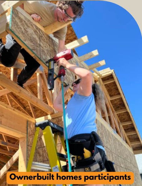
Ownerbuilt homes participants

in the community, creating opportunities for first-generation homeownership and long-term stability.